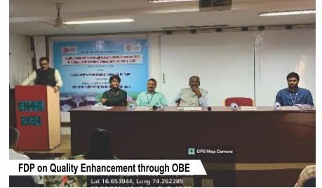
FDP on Quality Enhancement through OBE