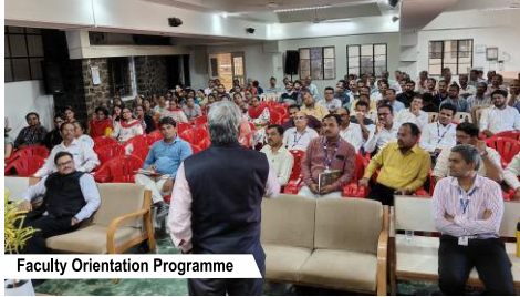
Faculty Orientation Programme