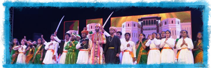
Famous Bollywood Playback Singer