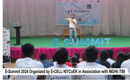
E-Summit 2024 Organized by E-CELL KITCoEK in Association with NIDHI ITBI