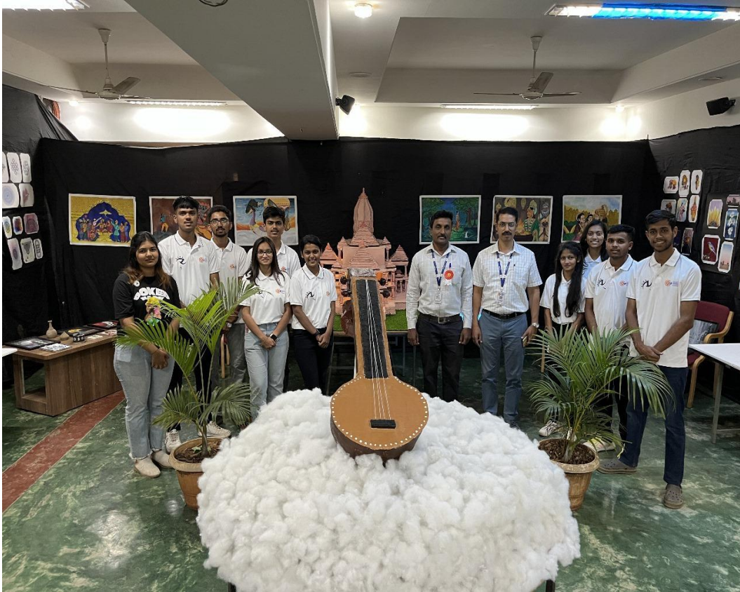
The art club 'AURA'