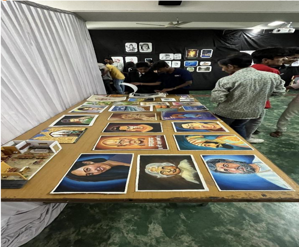
The art club 'AURA'