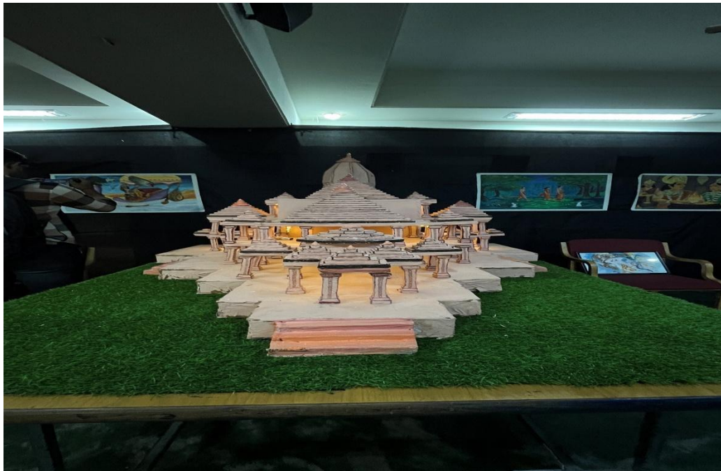
The art club 'AURA'